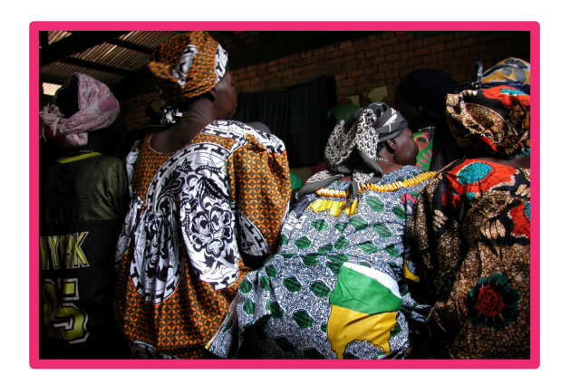
<u>Tip</u>: Focus on the actions taken by the person. This makes it possible to have a dynamic image, even if the subject present in the image is not identifiable.